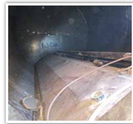
Internal Tank View of DuoVault™