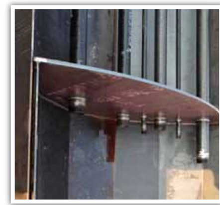
Connections of Small Secondary Vault