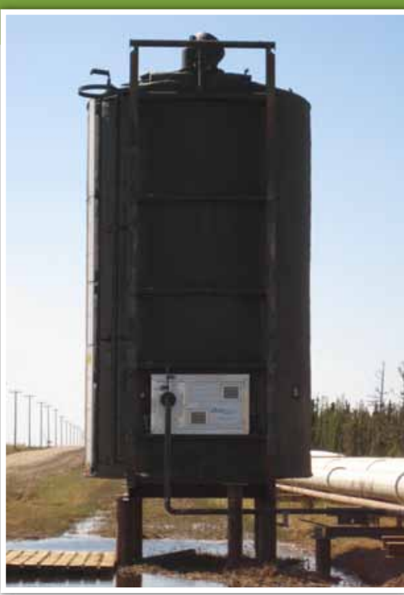
Complete DuoVault™ Tank

BLUE - Process fluid within primary tank GREEN - Interstitial Space / Secondary containment