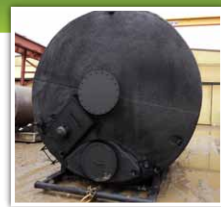
Top View of 400BBL DuoVault™ Tank