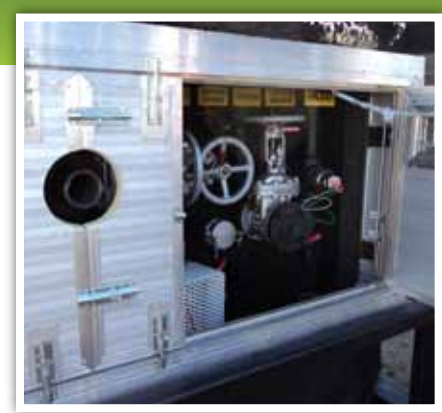
DuoVault™ Split Door System