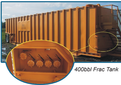
400bbl Frac Tank

In each quarterly edition we will feature an Enviro Vault for use in a different application.