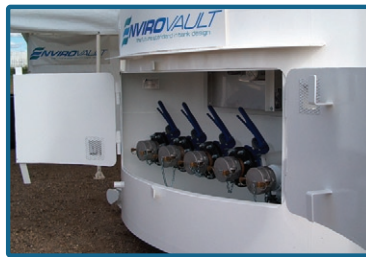
Vertical 400bbl d/w tank