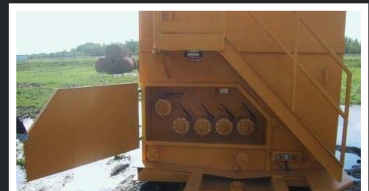
Frac-Tank w/ Enviro Vault®